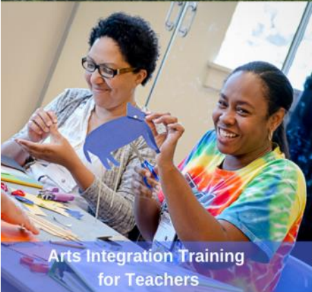
Arts Integration Training for Teachers

Building a better Wake County through the arts