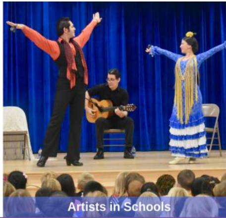
Artists in Schools