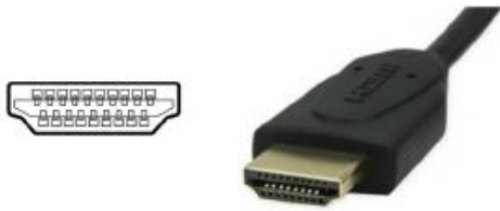
Standard HDMI Cable