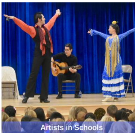
Artists in Schools