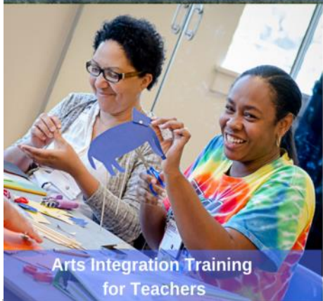
Arts Integration Training for Teachers

Building a better Wake County through the arts